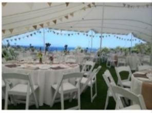
Table cloth - Trestle 3m x 1.4m black or white $ 13.00

Table cloth - Round 2.8 m black or white $ 22.00