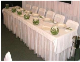
Table runners 2.7 x .240